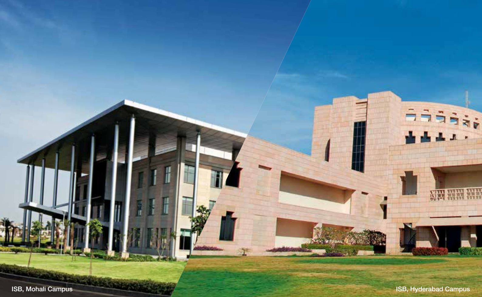
ISB, Mohali Campus