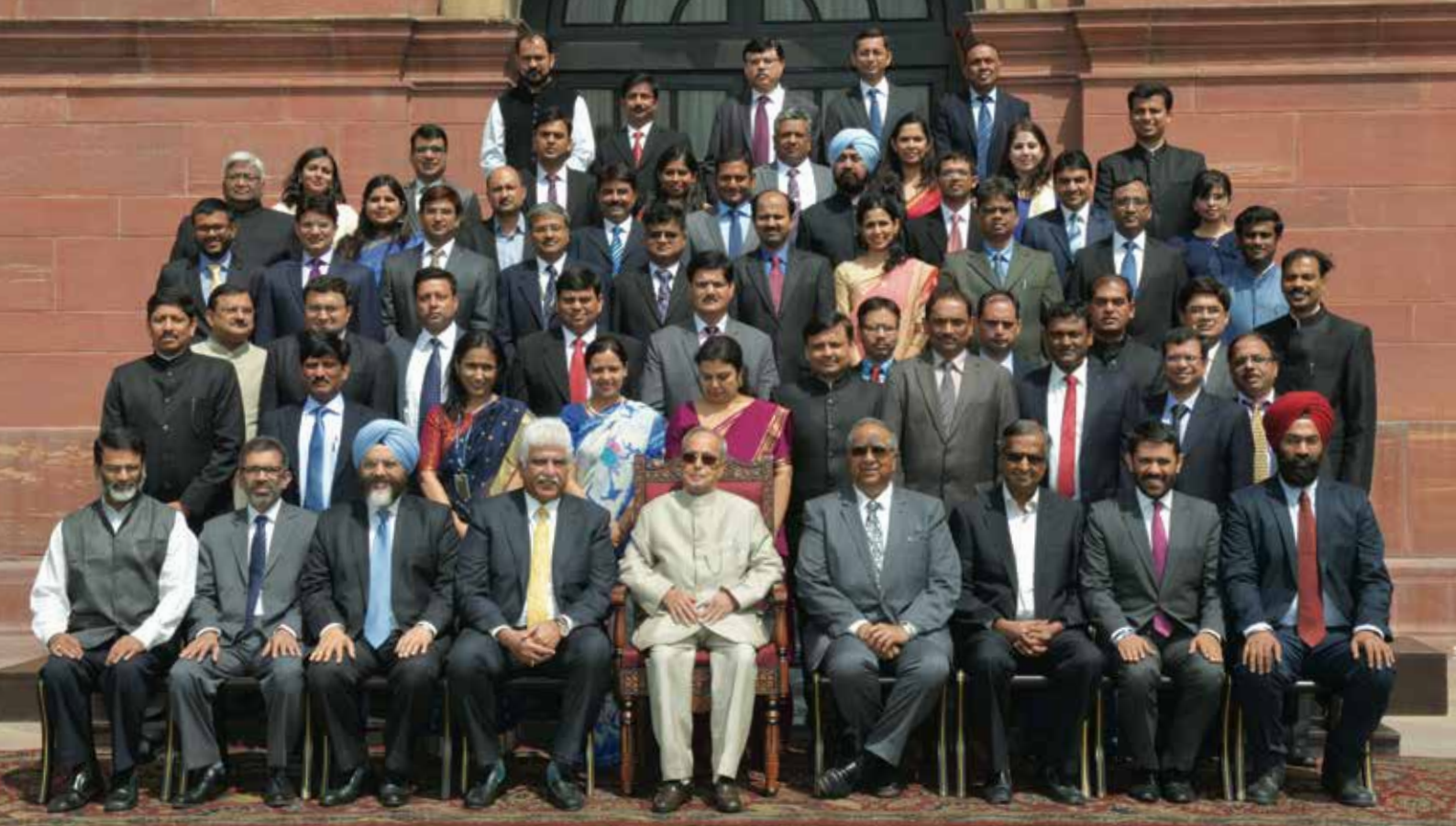
Honourable President of India, Shri Pranab Mukherjee, met with the students of the Founding Class at Rashtrapati Bhavan on their graduation