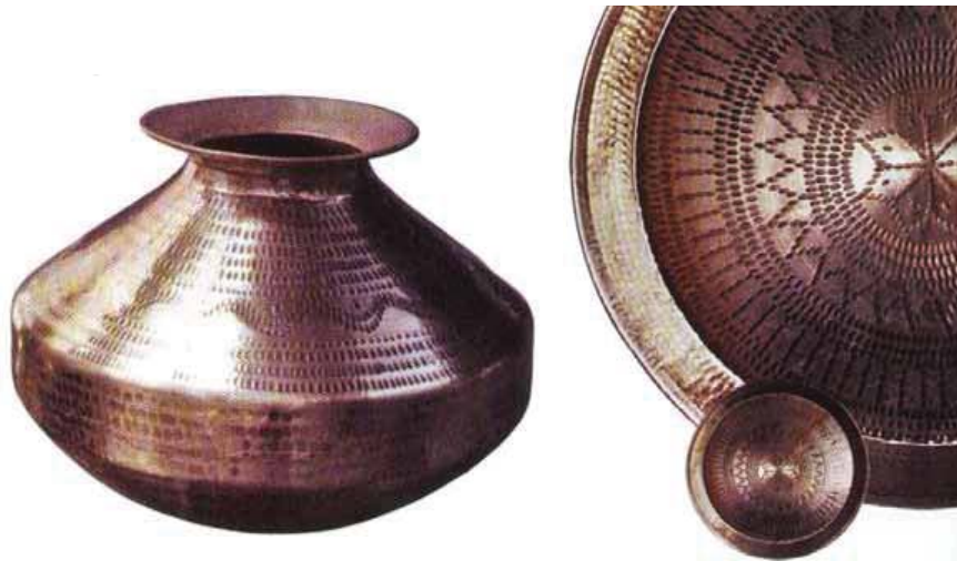
☪ Brassware Craft: Peetal Ke Bartan