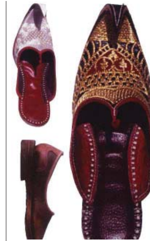
☪ Jutti- Leather footwear