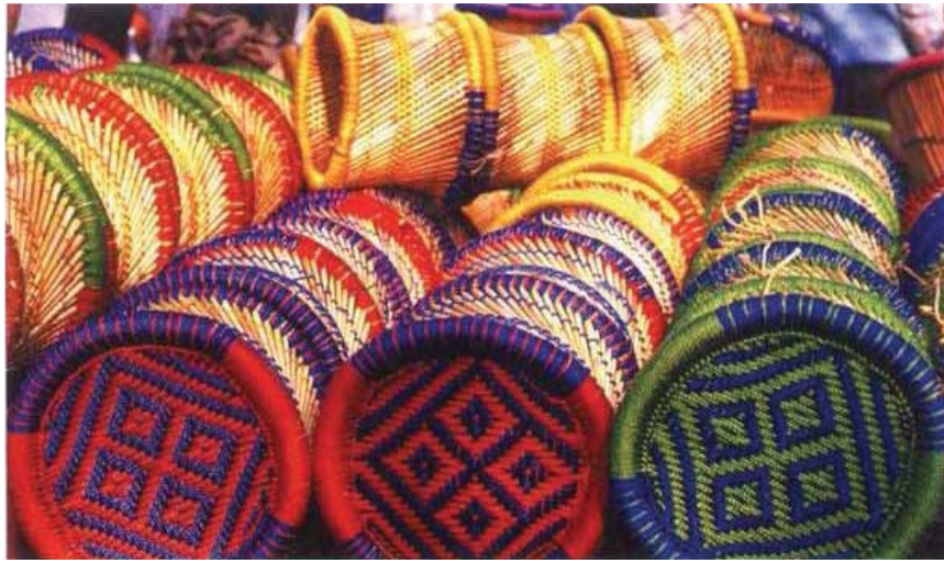
■ Sarkanda Craft