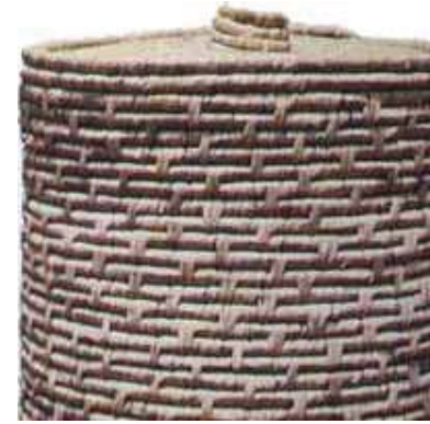
■ Palm leaf Craft : Phoos , Pula