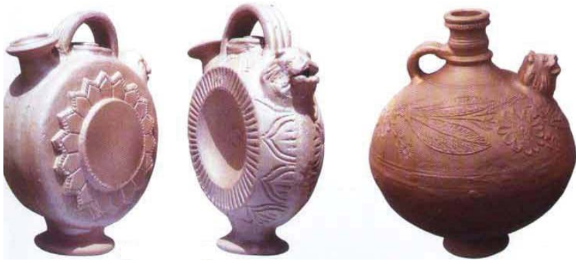
🏺 Surahi- Pottery Craft