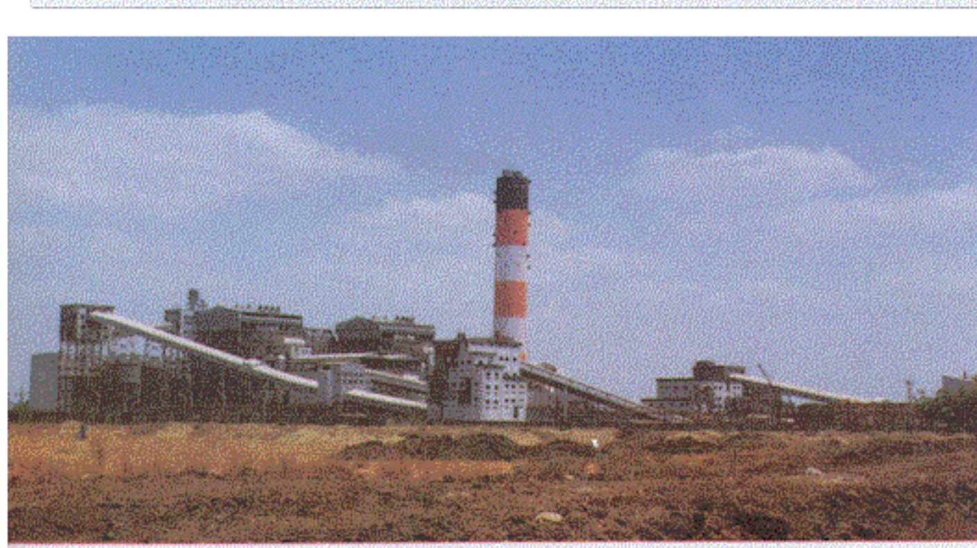
Lignite based, PIT Head, Surat Lignite Power Plant (C.F.B.C. Technology) of 2x125 MW Capacity, Gujarat