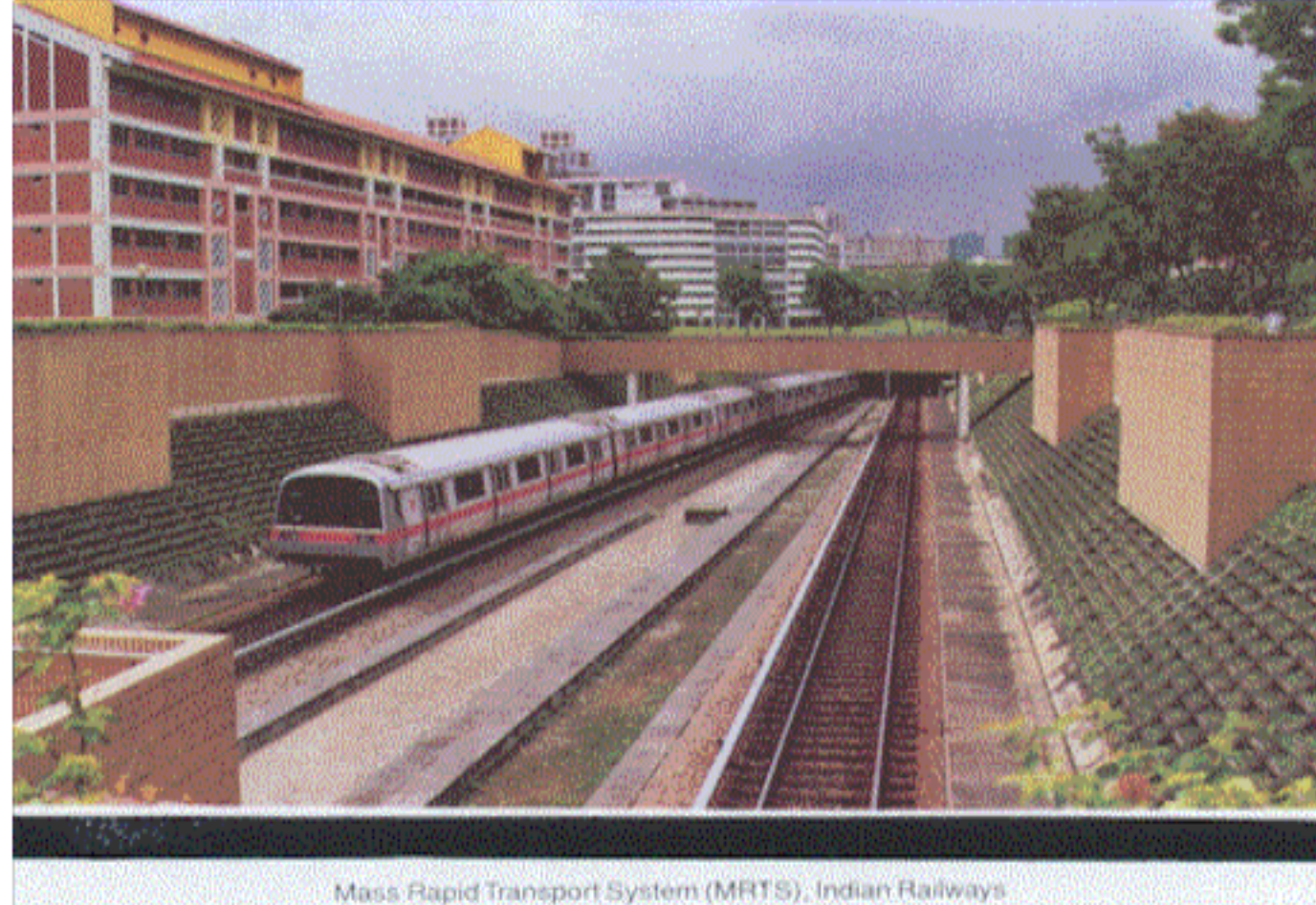
Mass Rapid Transport System (MRTS), Indian Railways

12.5 All the sectors except Coal and Provision of new village public telephone connections have achieved positive growth over the performance of April-October, 1998. As compared to the targets for the period, the performance of all the sectors except coal, steel, railways, crude oil and refinery production achieved/exceeded the targets for the period April-October, 1999. The trend in the overall infrastructure performance during April- October, 1999 vis-a-vis the target during the period and the performance of April-October, 1998 is at Annexure-1. Sector-wise details are as under: