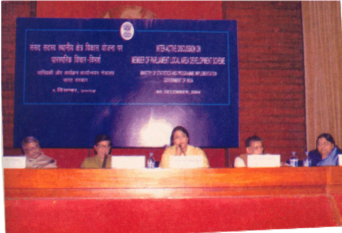
Shri Oscar Fernandes, Hon'ble Minister of State (Independent Charge) for Statistics and Programme Implementation addressing the inter-active discussion on Member of Parliament Local Area Development Scheme held on 9.12.2004.